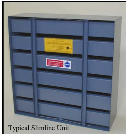
Typical Slimline Unit

Activated Carbon cells arranged in V-formation housed in a rigid steel unit. The carbon cells are easily removed and changed via the front access door. Replacement cells are readily available from EMCEL Filters.